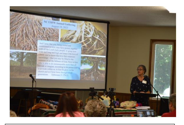
Devotions: Being rooted and established In Love.