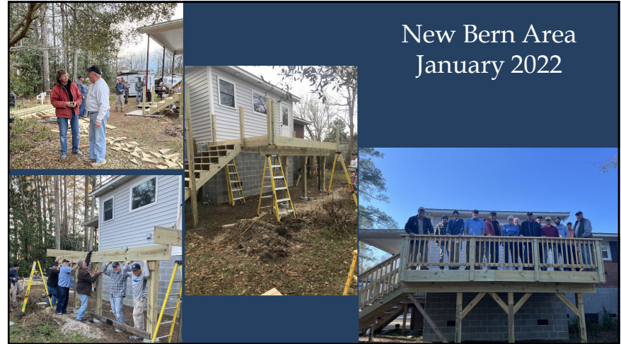
New Bern Area January 2022