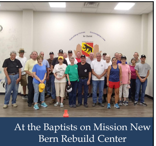
At the Baptists on Mission New Bern Rebuild Center