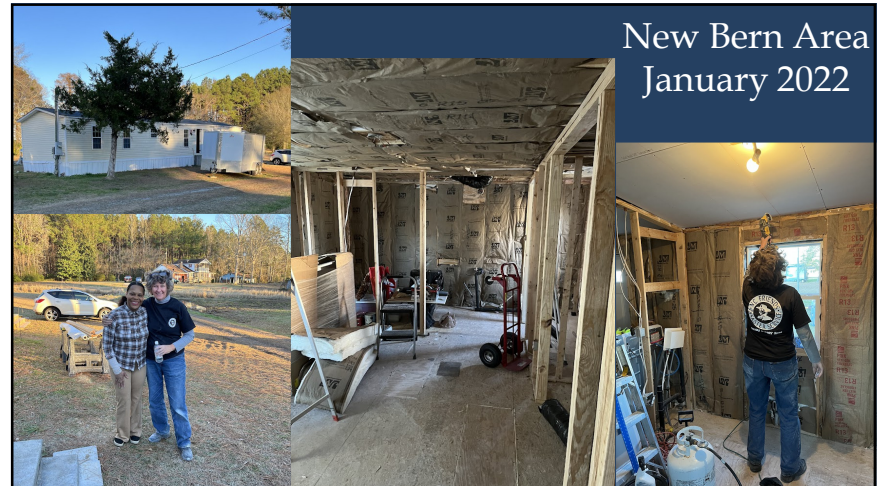
New Bern Area January 2022