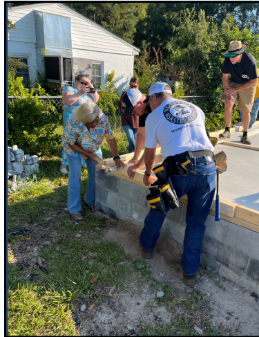
New Bern Area Cove City September 2022