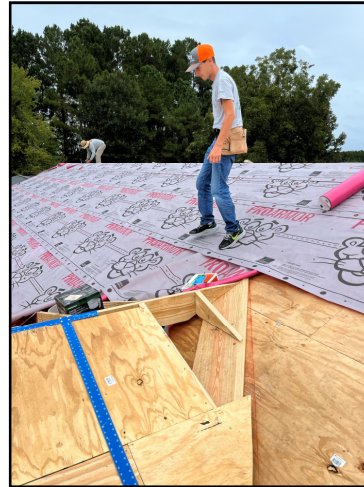
New Bern Area Cove City September 2022