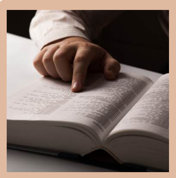
Log in HERE

There was a possible data breech in our directory. Therefore the password has been changed. Please reach out to Paul Routh to learn how to regain access.