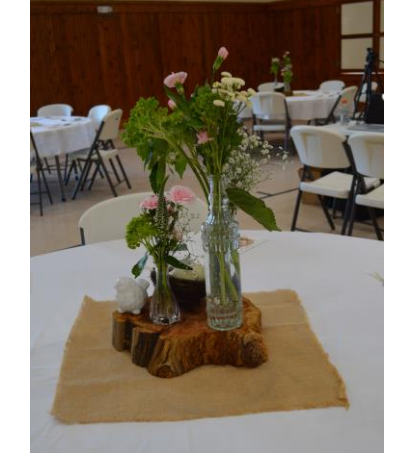
Table Centerpieces from Marlboro Friends