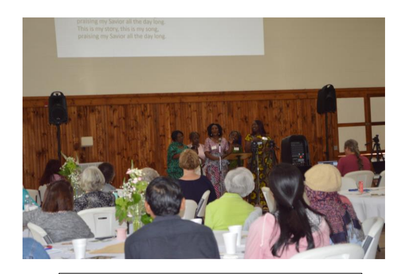
Baltimore Ladies with morning music