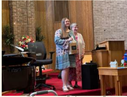
There were 4 graduates recognized