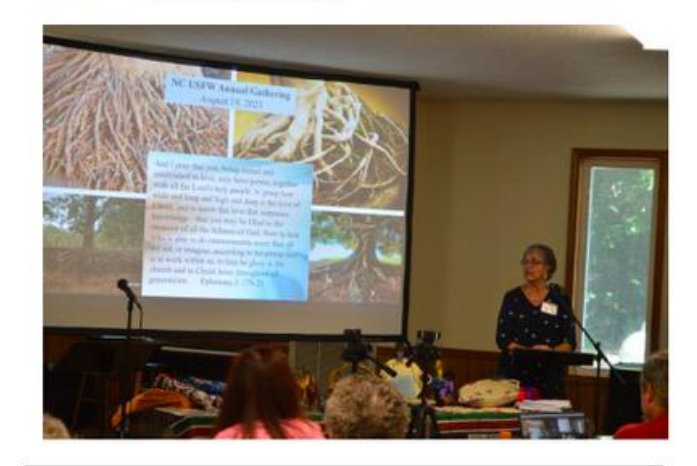
Devotions: Being rooted and established In Love.