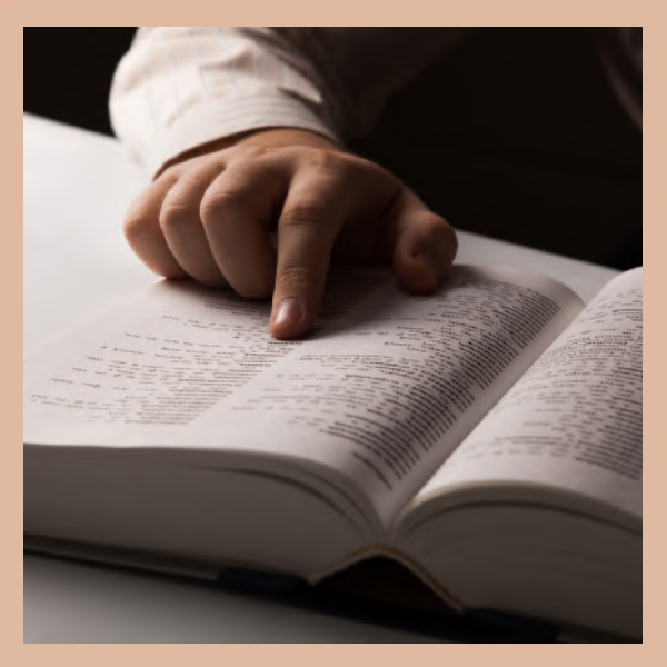
Log in HERE

Your updated version of the directory is now available on the FCNC website! Access to the directory will require a password. Click the link provided to head over to the website and enter the