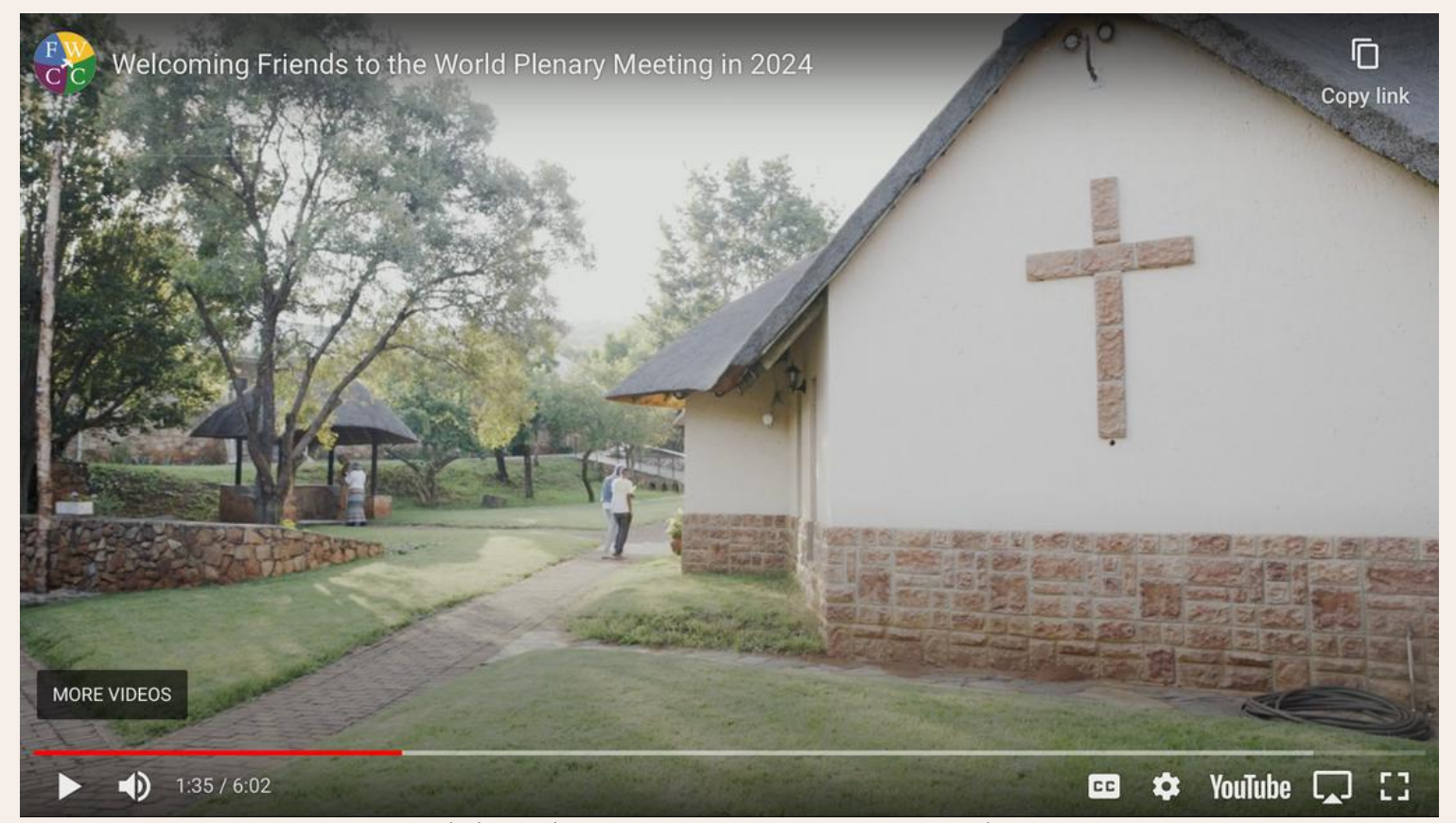
Click on the picture or HERE to access video

Show the above video in your Quaker Meeting or Friends Church, about what the word "ubuntu" means to Friends in Southern Africa. After watching it consider the Quaker Queries on page 17 for personal contemplation or together with others.